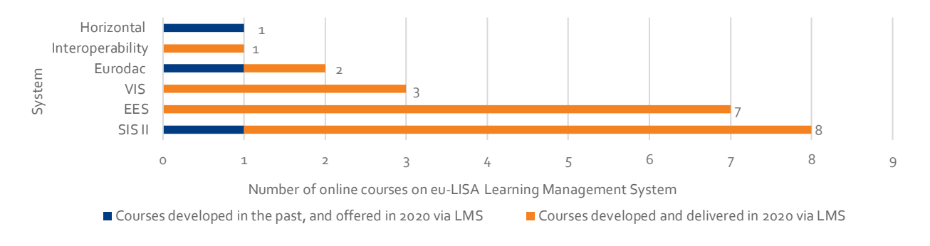
Figure 2. Number of courses per system offered in 2020

In total, 22 online courses were provided to the Member States in the eu-LISA LMS during 2020 (compared to five in 2019).