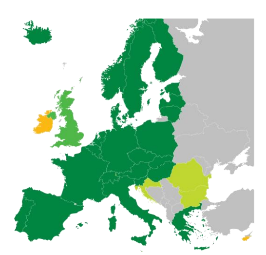
Figure 1. SIS II users in 2018

Public statistics can be accessed on eu-LISA's website.