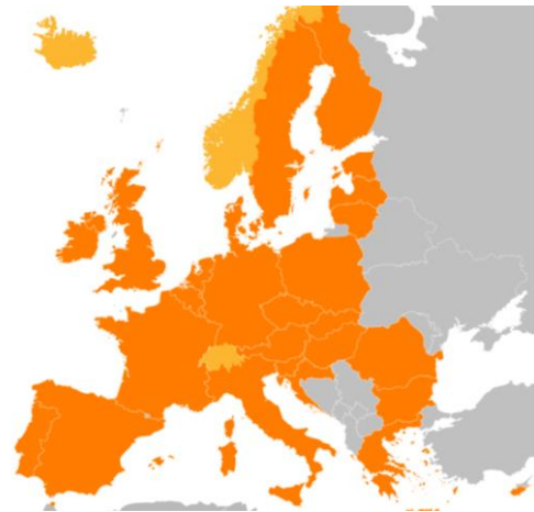
Figure 1. Eurodac users

Public statistics can be accessed on eu-LISA's website.